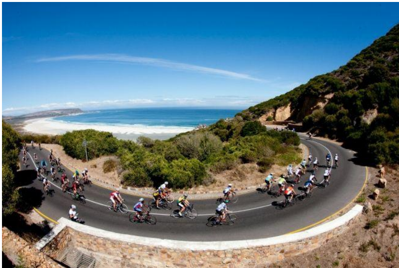
Cape Town Cycle Tour

Over the past year, Cape Town has hosted a wide range of major events, with a notable peak in November when over 200 events were held. December's numbers were predicted to nearly double, with 53 approved events on one weekend alone. Highlights for Green Point included the Cape Town Cycle Tour, the Cape Town Marathon (though traffic congestion was an issue), the Earthshot Awards attended by Prince William, the Freestyle Kings event (surprisingly quiet), and the sold-out Springboks vs All Blacks game. More recently, the HSBC 7s tournament brought steady traffic flow to the area.