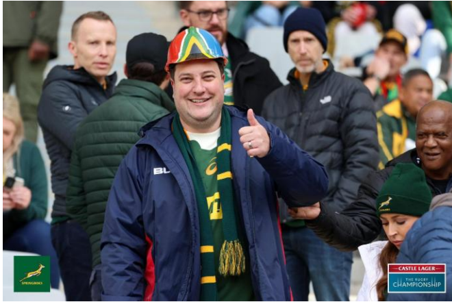
Mayor Geordin Hill-Lewis at Springbok vs Australia, 23 Aug 2025