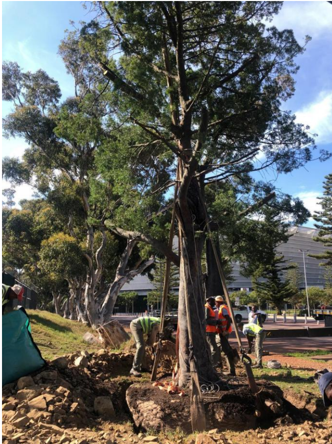
Relocation of Yellowwood tree to the Green Point Common

We also recognise the importance of protection trees in our neighbourhood. A noble example is the Yellowwood tree at 8 Ocean View Drive which survived the demolition of the house in 2017. At the request of the City's Environmental & Heritage Management, the tree was safeguarded during both demolition and the subsequent (but unrealized) development. With new plans pending, provisions were made for the tree to be transplanted to a safer environment. Its roots were carefully excavated and, using the largest available crane, it was relocated to the Cricket Club on the Green Point Common. Today, it continues to thrive as a proud 'soldier' in the battle against climate change.