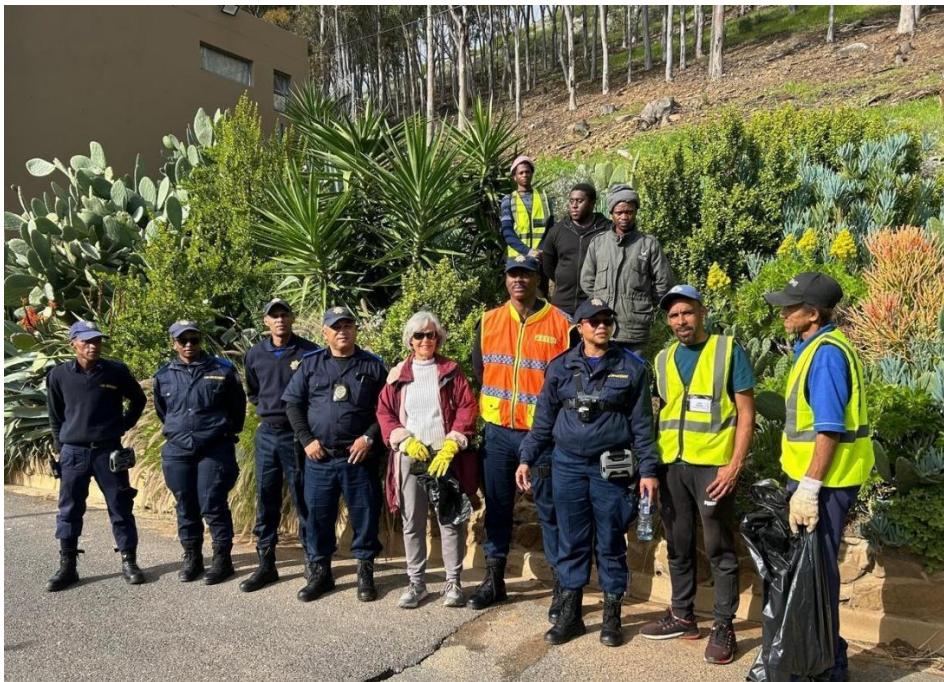
Law Enforcement, SANParks, GPRRA SafeStreet Collective & residents